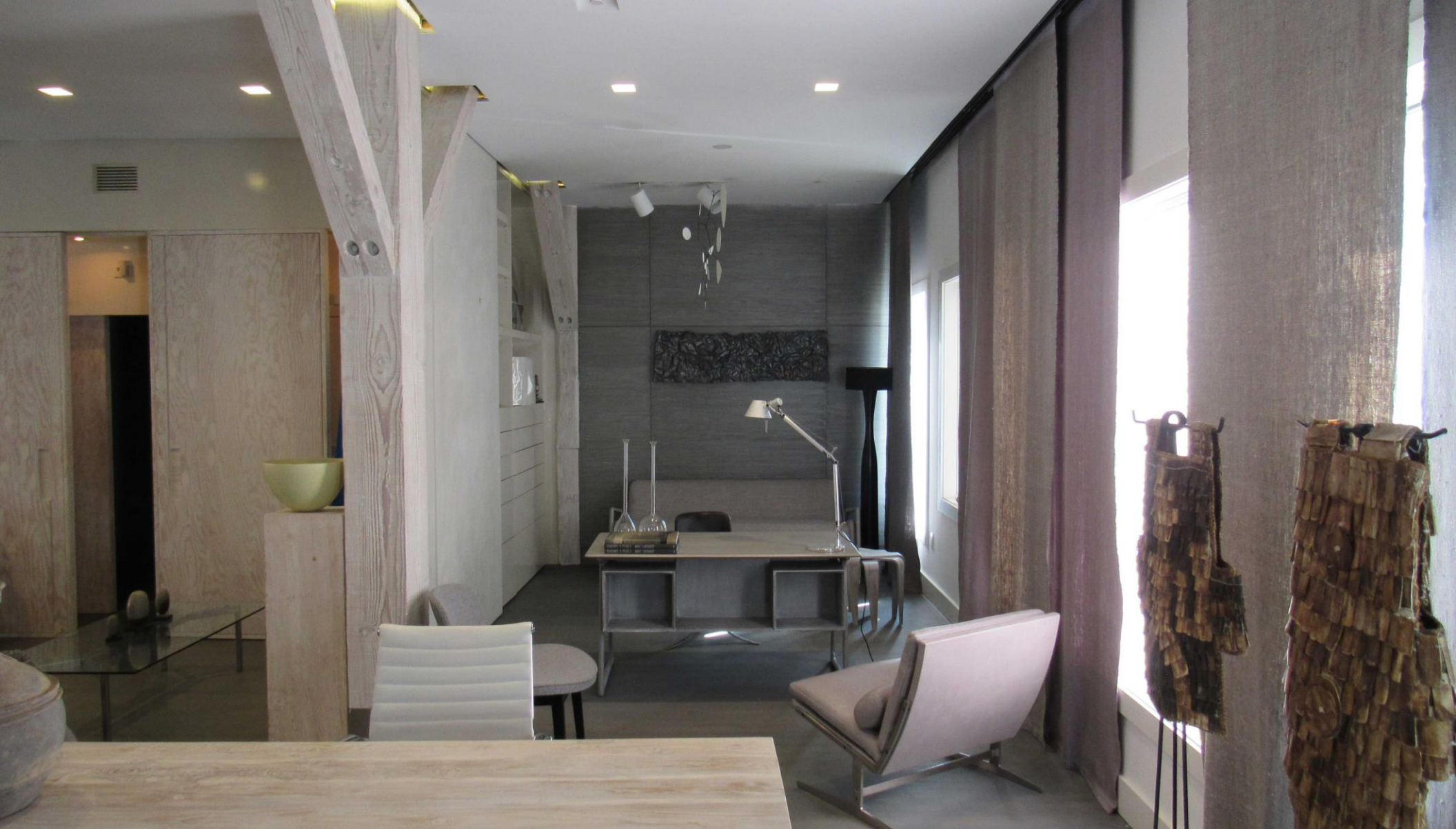
Current Office Area