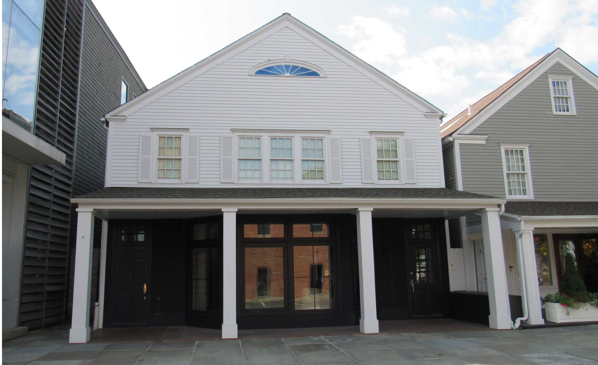
Alternate building view