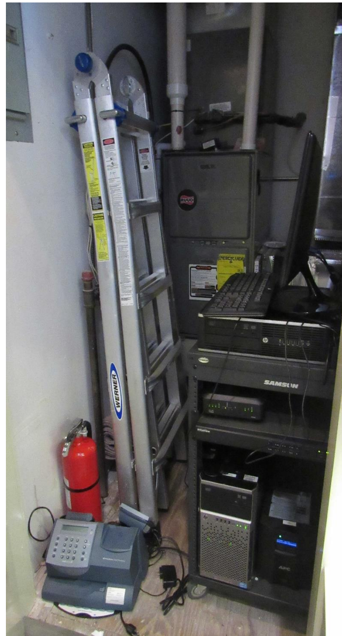
Mechanical, Server Room