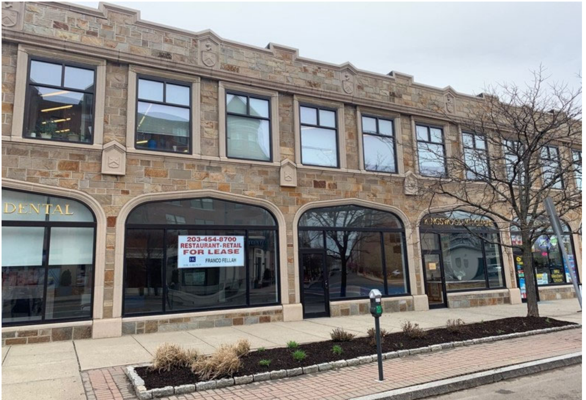
Very Wide Double Storefront