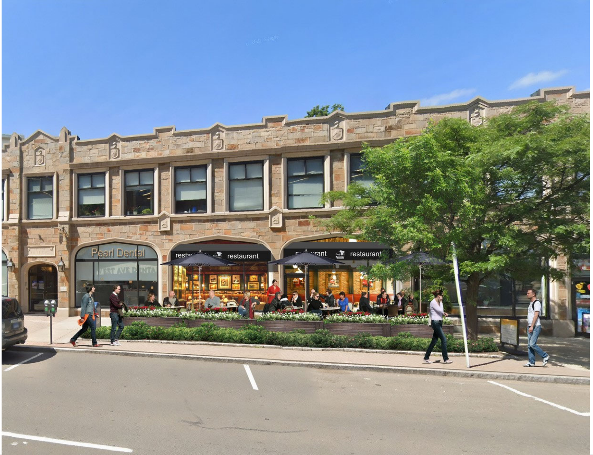
520 West Ave – Restaurant, Medical, Retail or Office in densely populated Waypointe area Norwalk, CT 06850 Fairfield County