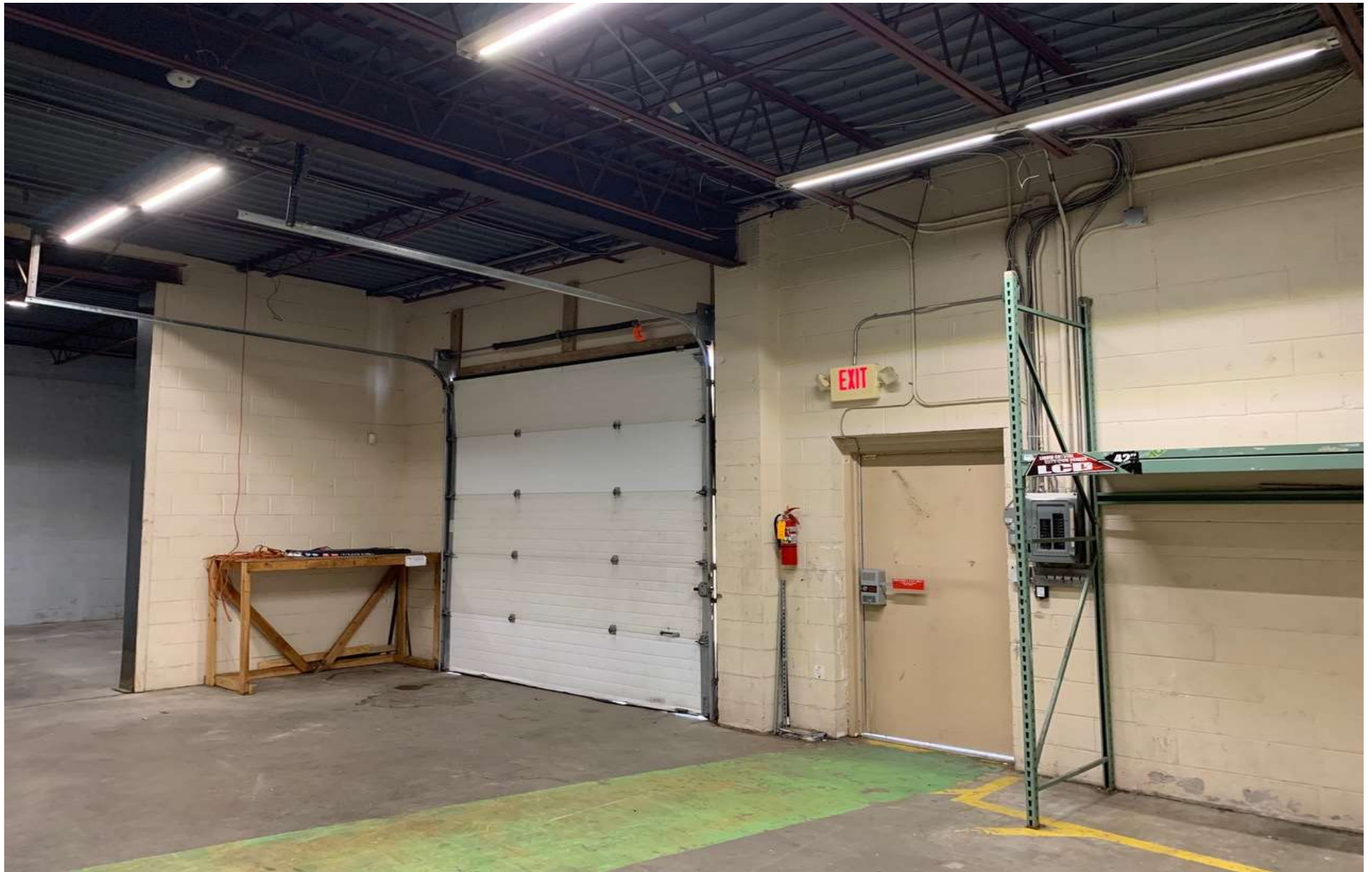
Drive-In Door to Warehouse Area