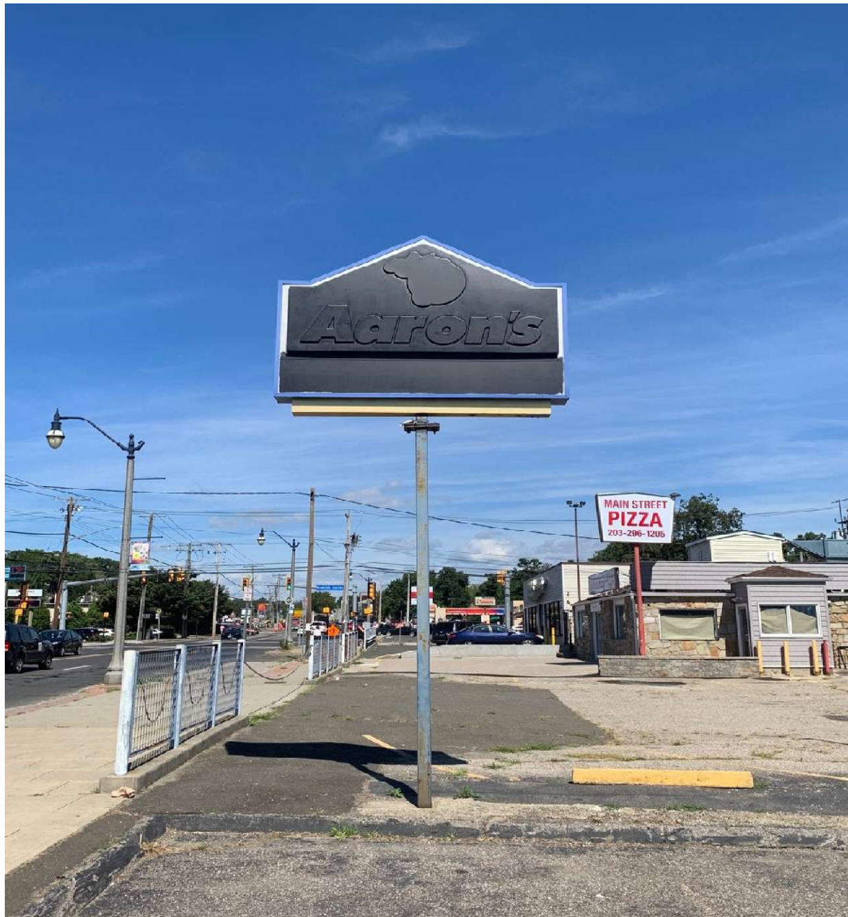
Pylon Sign – Directly on Main Street