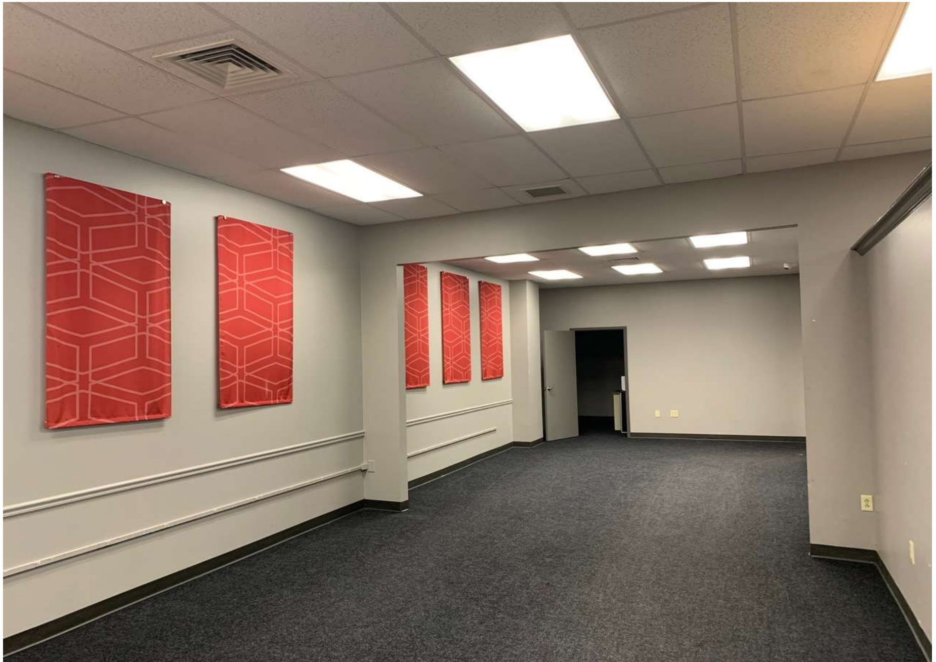
Back of the store