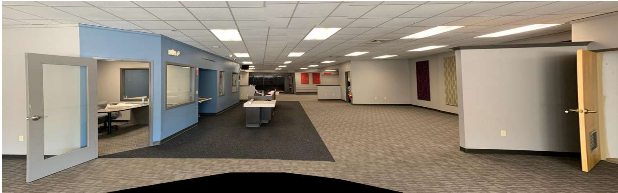
Main Space - Interior