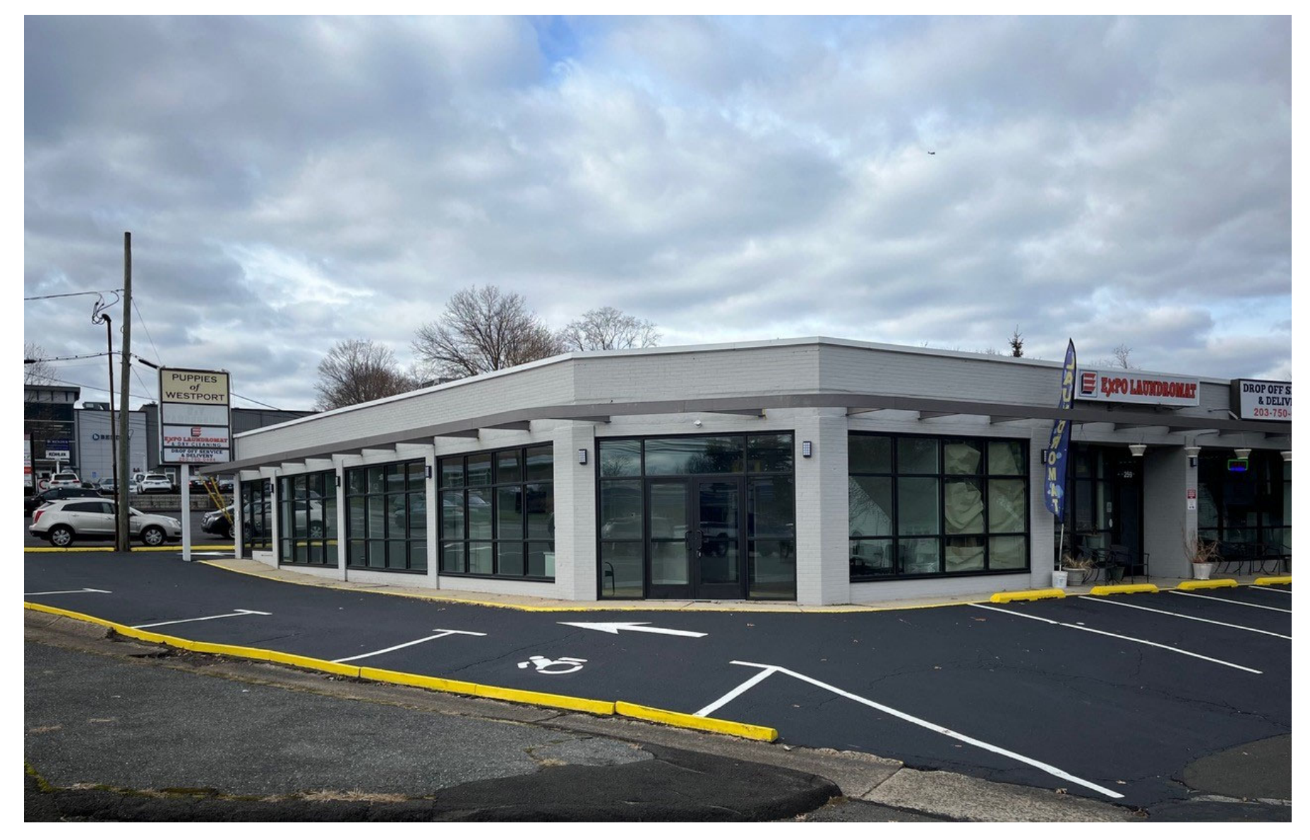
Brand New Turn-Key Medical Space For Sublease 255 Westport Avenue (US-1), Norwalk, Connecticut