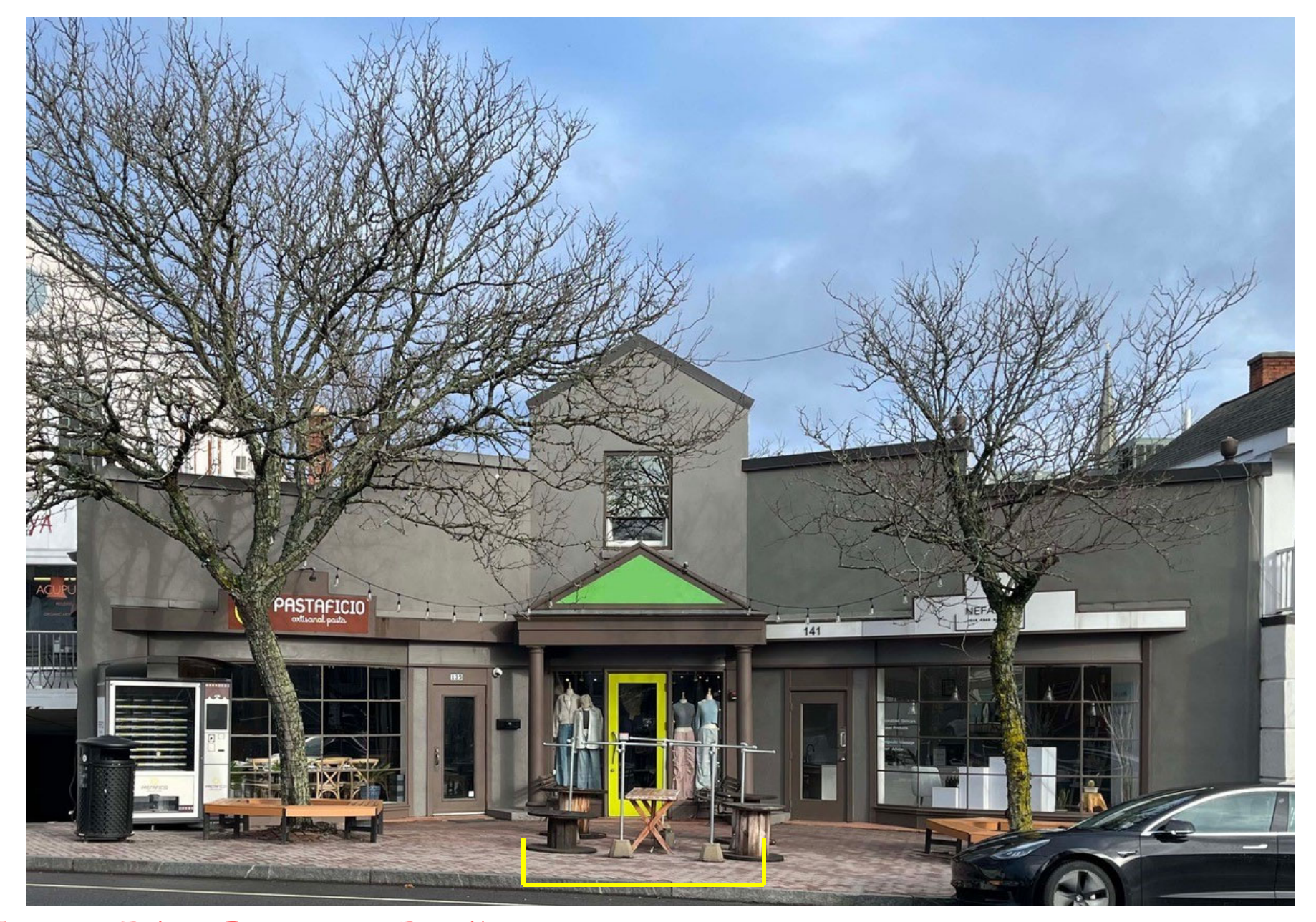
For Lease - Prime Downtown Retail

139 Post Road East (US-1), Westport, Connecticut – Fairfield County